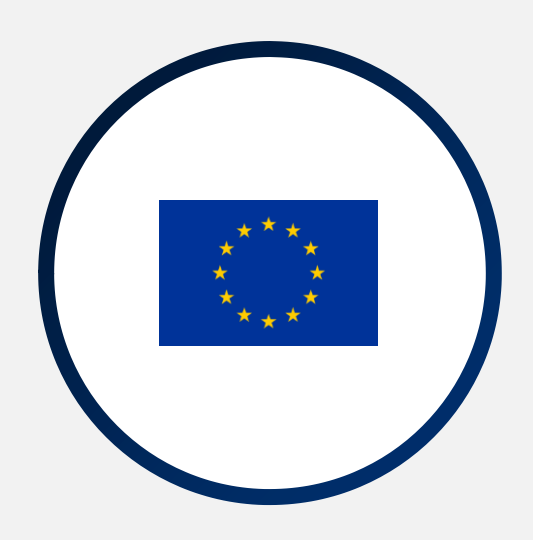
General UK-EU consumer protection