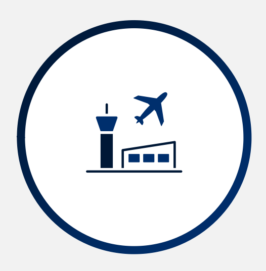
Package travel and timeshare regulations